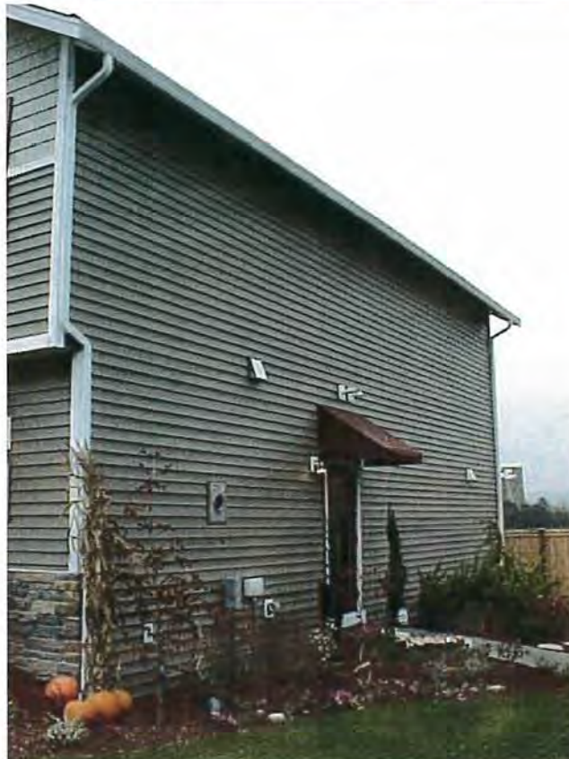
Lot 70 North Face 11-07-07