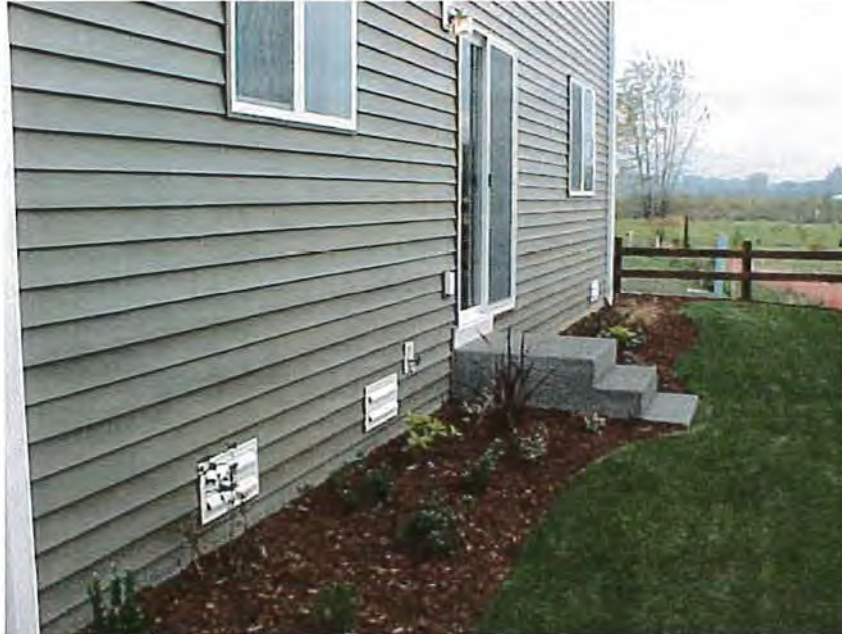
Lot 70 West Face 11-07-07

If submitting more photographs than will fit on the preceding page, affix the additional photographs below. Identify all photographs with: date taken; "Front View" and "Rear View"; and, if required, "Right Side View" and "Left Side View."