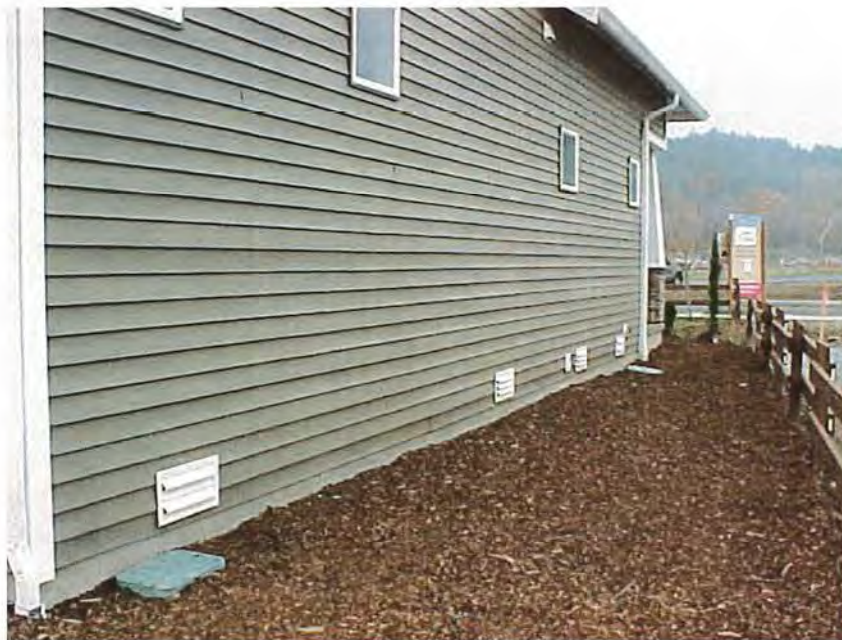
Lot 70 South Face 11-07-07