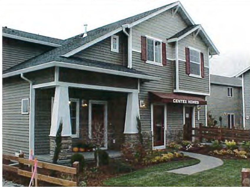
Lot 70 East Face 11-07-07

If using the Elevation Certificate to obtain NFIP flood insurance, affix at least two building photographs below according to the instructions for Item A6. Identify all photographs with: date taken; "Front View" and "Rear View"; and, if required, "Right Side View" and "Left Side View." If submitting more photographs than will fit on this page, use the Continuation Page, following.